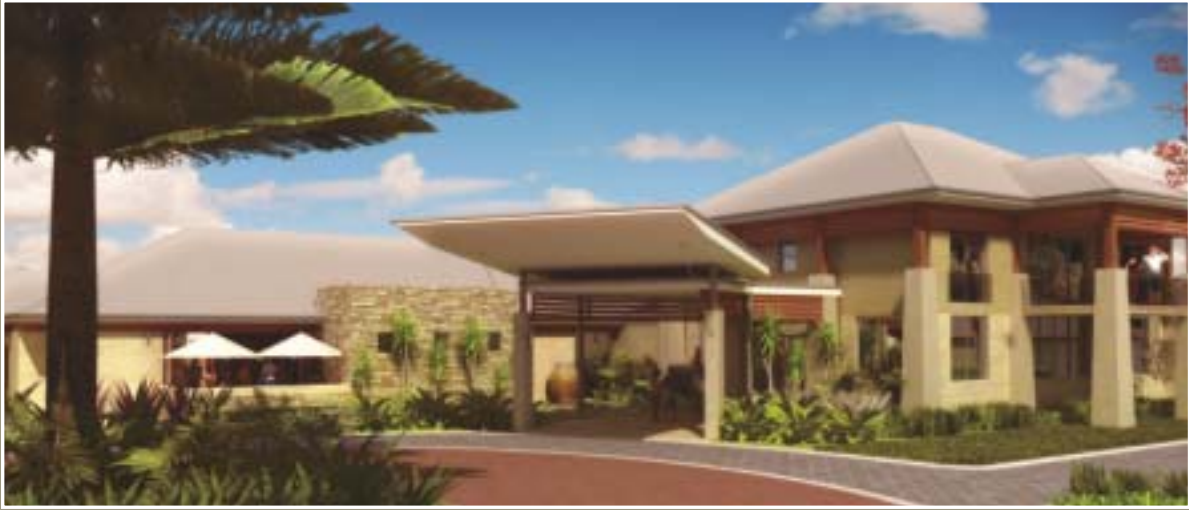
Proposed Clubhouse illustration