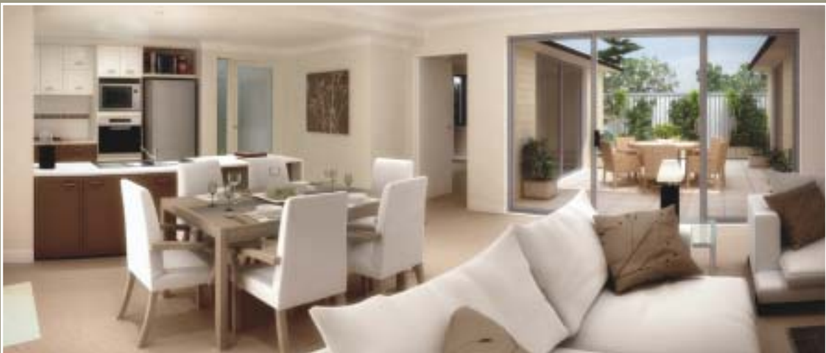
Internal layout illustration

oun. freedom, flexibility, scope, breathing space, liberty, and fr