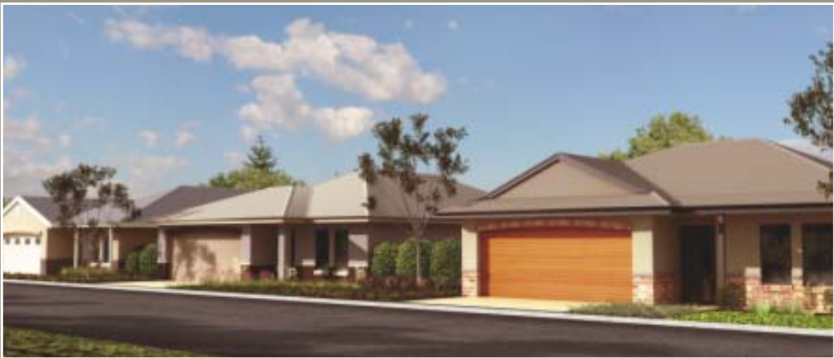
Typical streetscape illustration